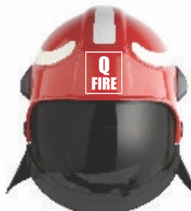
Optional dark visor