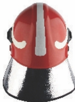
Removable aluminized carbon-fibre neck protector