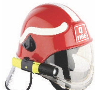
Optional lamp integration