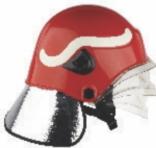
Flip down face visor