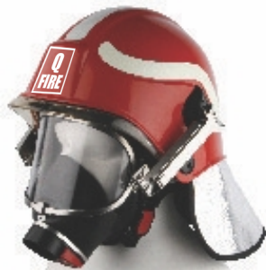
Ready to use with a mask