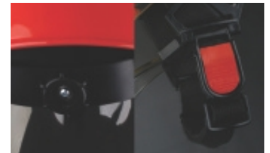
Adjustment system with triangle connections and a quick release button.